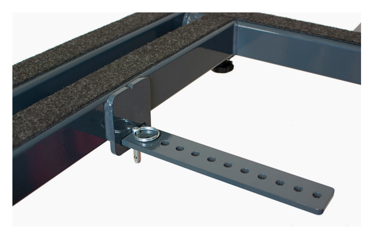
FIG. 1: SAFETY SPLINTER WITH PIN INSTALLED