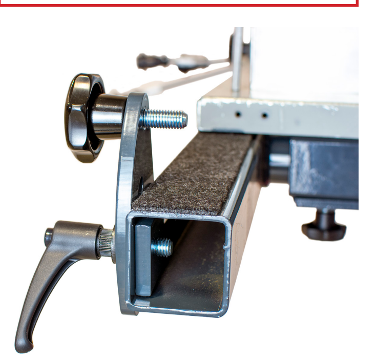
FIG. 7 (ABOVE): ADJUSTABLE HANDLE